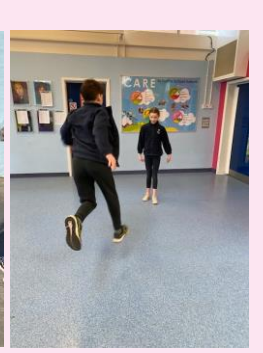
In Year 4 Dance Club, children are creating and choreographing a dance based on Alice's Adventures in Wonderland.