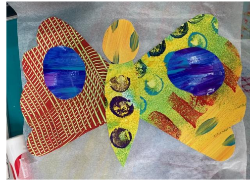
3. Arrange to make your own mini-beasts