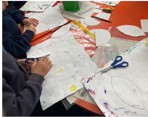
2. Cut out shapes