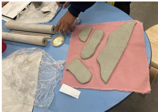
1. Roll out clay and cut out pieces