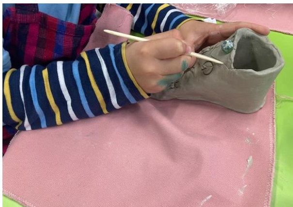
3. Embellish your design