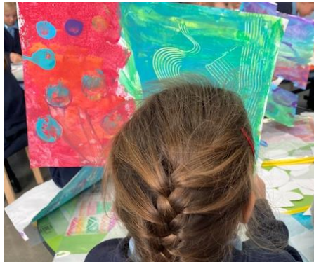
1. Create a range of papers with different colours and textures

Inspired by 'The Hungry Caterpillar' collage by Eric Carle