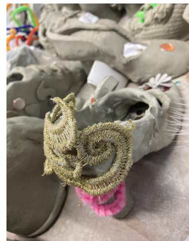
4. Leave to dry

More photos to come of the finished products . . .