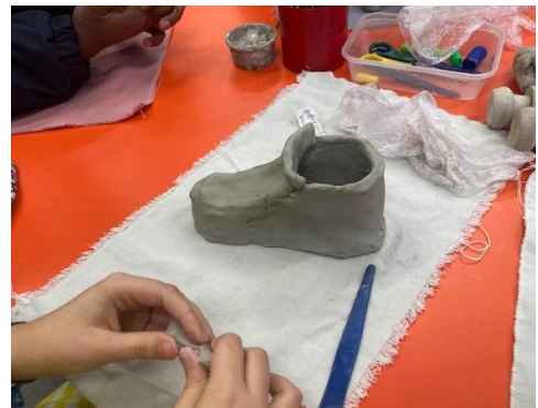
2. Join together with scoring and slip