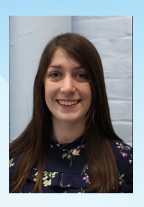
Sami Burst Infants Monday-Wednesday